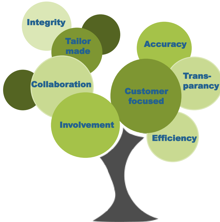
Our tree of values